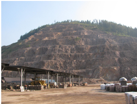
FIGURE 4 Effusive igneous rock formation showing several layers from which material is being quarried.

Given sufficient time and certain exposure conditions, any stone is vulnerable to some degree of deterioration when exposed to environmental weathering. Test methods and evaluations that provide a better understanding of the potential for poor in-service durability are a critical part of the stone selection process. The following is a systematic approach for evaluating a stone type for durability. Each task provides a progressively rigorous review; however, if one of the first tasks indicates a marginal or poor quality stone, it is likely time/cost effective to consider an alternative stone.