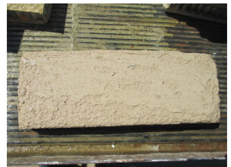
FIGURE 8 More advanced surface spalling of limestone specimen.

Simulated weathering testing that is most often performed is used to evaluate the effect of temperature extremes and freeze/thaw cycles in the presence of moisture on stone durability. For some stone types, durability can be assessed to a certain degree using procedures for evaluating concrete durability outlined in ASTM C666, Standard Test Method for Resistance of Concrete to Rapid Freezing and Thawing .