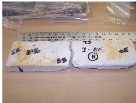
FIGURE 5 Varying degrees of deterioration exhibited by specimens after accelerated weathering exposure. Heavily deteriorated and cracked marble specimen.

Durability testing is particularly useful for a stone with unknown or limited performance history, or for stone that does not meet the minimum specified physical properties for that stone type, to reduce the risk of using a poor durability stone on a project. These tests are greater cost and longer duration than the standard physical/mechanical tests but provide the most accurate durability assessment of a stone with limited historical precedent in severe weathering applications. While durability tests may not be of great value on a new project when using a stone that has an established history of use in the environment similar to that being considered, they may be appropriate for large or high-profile projects in which testing represents a small percentage of the total project cost regardless of the stone type. See Figures 5–8.