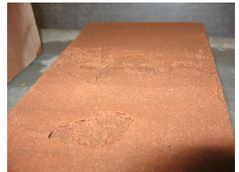
FIGURE 6 Surface spalling of sandstone specimen.