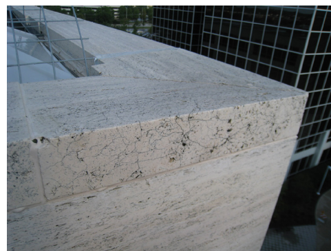
FIGURE 2 Typical freeze/thaw damage to a travertine coping stone.