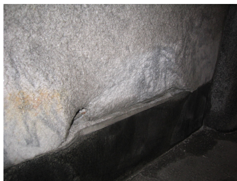
FIGURE 1 Examples of deterioration that are influenced by location on a building. Marble deterioration at the base of a building due to deicing salts.